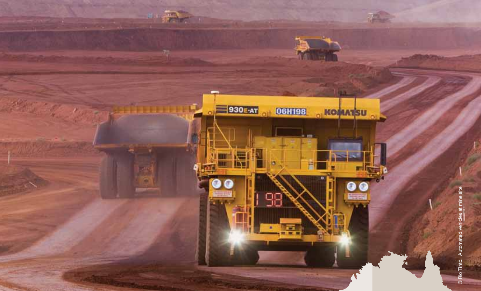
© Rio Tinto. Automated vehicles at mine site.