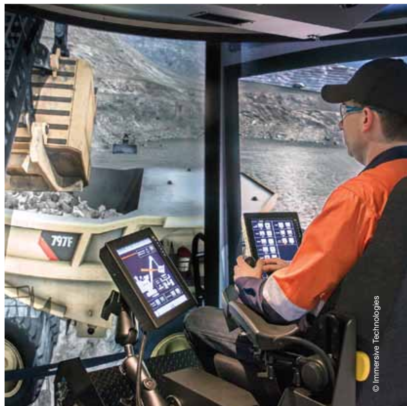
Immersive Technologies' Caterpillar® 7945 Rope Shovel Training Simulator.